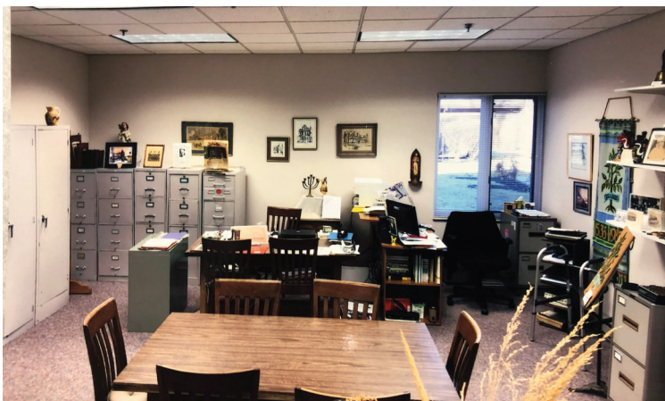
Toledo Ursuline's current archive room

(Information was taken from the May and June 2023 WRAC newsletters)